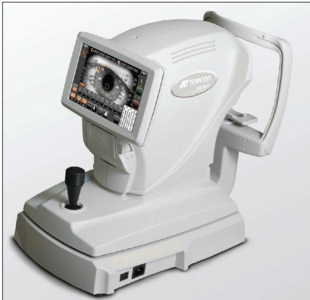
Figure 1. The KR-800S Auto Kerato/Refractometer incorporates subjective visual acuity testing along with autorefractometry.