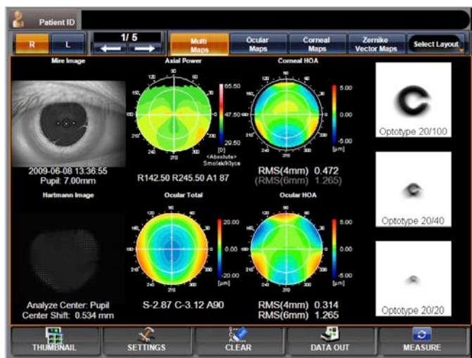
Figure 2: Results captured by the KR-1W are presented visually as maps, allowing the doctor to easily identify the cause of a patient's visual complaints.

I started using the KR-1W approximately 3 years ago, with the aim of evaluating how helpful such a system would be in the pre- and postoperative management of cataract surgery patients. This idea arose from my awareness that three key surgical steps – pupillometry, IOL selection, and IOL implantation – are all supported by the capabilities of the KR-1W. Specifically, the system permits the measurement of the types of aberration – higher order aberration (HOA) – that cannot be corrected by IOL implantation. Corneal asphericity and astigmatism are also measurable with the system. Doing so at a preoperative stage allows the physician to ascertain the amount of correction and asphericity required from any toric IOL proposed for astigmatism correction and for the correct IOL power to be selected before implantation. It also helps to identify and rule out candidates who are unsuitable for multifocal IOL implantation by nature of very high levels of astigmatism.