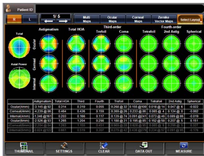
Figure 3: The KR-1W features a component map display which shows the high order aberrations for the entire ocular system.

larities from previous surgery can be identified, and non-conventional formulas devised to accommodate the presence of such corneal irregularities can be used to calculate preoperative lens power rather than standard formulas. Finally, postoperative measurement of residual ocular astigmatism can be conducted with the machine to ensure prompt identification of required postoperative refractive adjustments.