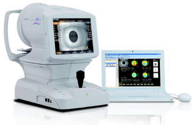
Figure 1: The 5-in-1 KR-1W significantly reduces the time, equipment and spatial requirements associated with visual assessment.

The KR-1W is a wavefront analyzer designed to perform the five most important types of visual assessment required by refractive surgery patients: topography, aberrometry, pupillometry, refractometry, and keratometry. By combining technologies specific to wavefront aberration,