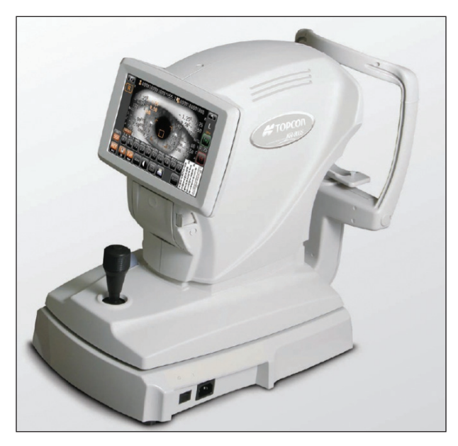
Figure 1. The KR-800S Auto Kerato/Refractometer incorporates subjective visual acuity testing along with autorefraction.